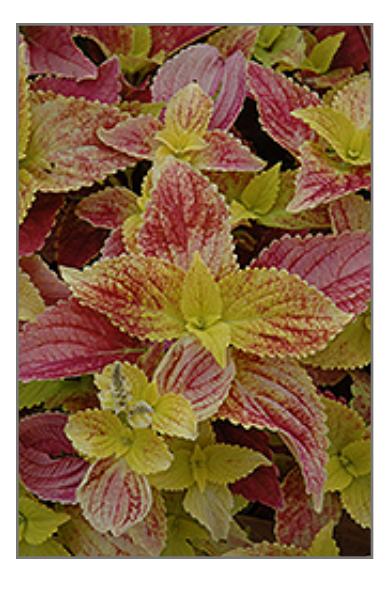
Texas Parking Lot Coleus foliage

Texas Parking Lot Coleus will grow to be about 3 feet tall at maturity, with a spread of 24 inches. When grown in masses or used as a bedding plant, individual plants should be spaced approximately 20 inches apart. Although it's not a true annual, this fast-growing plant can be expected to behave as an annual in our climate if left outdoors over the winter, usually needing replacement the following year. As such, gardeners should take into consideration that it will perform differently than it would in its native habitat.