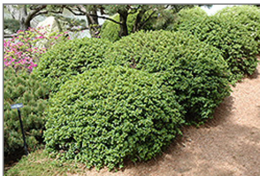
Green Mound Alpine Currant