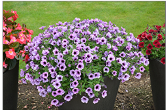
Supertunia Bordeaux Petunia in bloom

Supertunia Bordeaux Petunia will grow to be about 10 inches tall at maturity, with a spread of 24 inches. When grown in masses or used as a bedding plant, individual plants should be spaced approximately 20 inches apart. Its foliage tends to remain low and dense right to the ground. This fast-growing annual will normally live for one full growing season, needing replacement the following year.