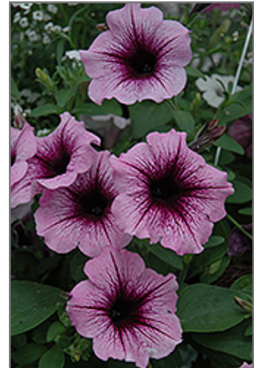
Supertunia Bordeaux Petunia flowers

Supertunia Bordeaux Petunia is recommended for the following landscape applications;