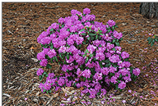
Compact P.J.M. Rhododendron in bloom