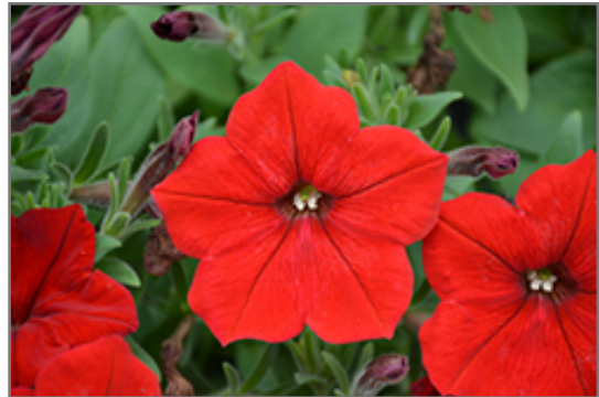
Easy Wave Red Petunia flowers

Easy Wave Red Petunia is a dense herbaceous annual with a trailing habit of growth, eventually spilling over the edges of hanging baskets and containers. Its medium texture blends into the garden, but can always be balanced by a couple of finer or coarser plants for an effective composition.