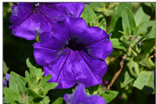
Easy Wave Blue Petunia flowers