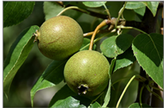
Golden Spice Pear fruit Photo courtesy of NetPS Plant Finder