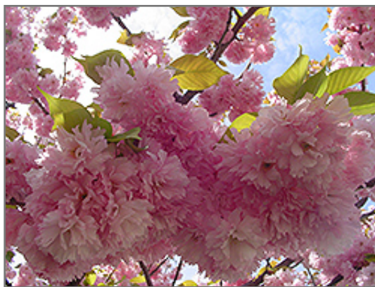
Kwanzan Flowering Cherry flowers

This is a high maintenance tree that will require regular care and upkeep, and is best pruned in late winter once the threat of extreme cold has passed. Gardeners should be aware of the following characteristic(s) that may warrant special consideration;