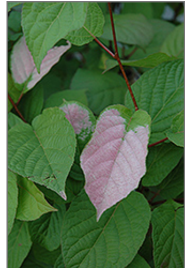
September Sun Kiwi foliage

September Sun Kiwi is a dense multi-stemmed deciduous woody vine with a twining and trailing habit of growth. Its average texture blends into the landscape, but can be balanced by one or two finer or coarser trees or shrubs for an effective composition.