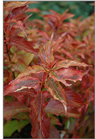
My Monet Sunset Weigela foliage

My Monet Sunset Weigela makes a fine choice for the outdoor landscape, but it is also well-suited for use in outdoor pots and containers. It is often used as a 'filler' in the 'spiller-thriller-filler' container combination, providing a mass of flowers and foliage against which the thriller plants stand out. Note that when grown in a container, it may not perform exactly as indicated on the tag - this is to be expected. Also note that when growing plants in outdoor containers and baskets, they may require more frequent waterings than they would in the yard or garden.