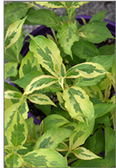
My Monet Sunset Weigela foliage

My Monet Sunset Weigela is recommended for the following landscape applications;