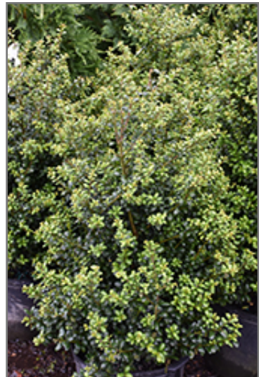
Chesapeake Japanese Holly