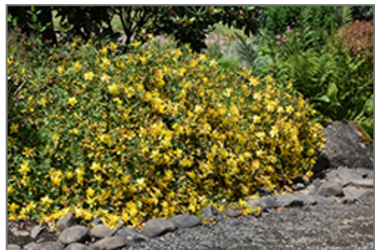
Hidcote St. John's Wort in bloom