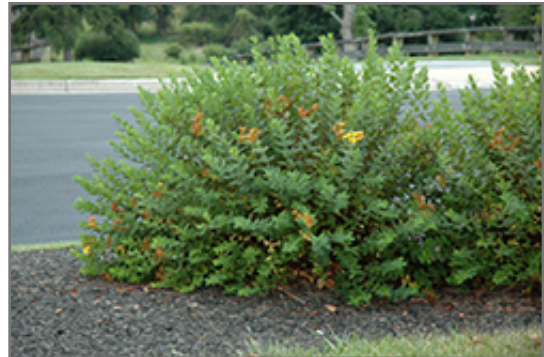
Hidcote St. John's Wort

Hidcote St. John's Wort makes a fine choice for the outdoor landscape, but it is also well-suited for use in outdoor pots and containers. With its upright habit of growth, it is best suited for use as a 'thriller' in the 'spiller-thriller-filler' container combination; plant it near the center of the pot, surrounded by smaller plants and those that spill over the edges. It is even sizeable enough that it can be grown alone in a suitable container. Note that when grown in a container, it may not perform exactly as indicated on the tag - this is to be expected. Also note that when growing plants in outdoor containers and baskets, they may require more frequent waterings than they would in the yard or garden.