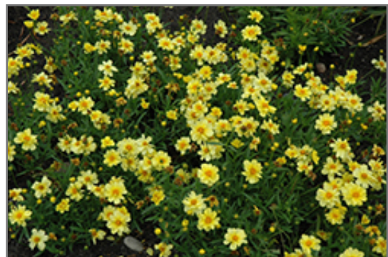
Galaxy Tickseed in bloom