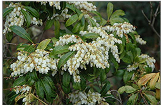
Red Mill Japanese Pieris flowers

Red Mill Japanese Pieris is recommended for the following landscape applications;