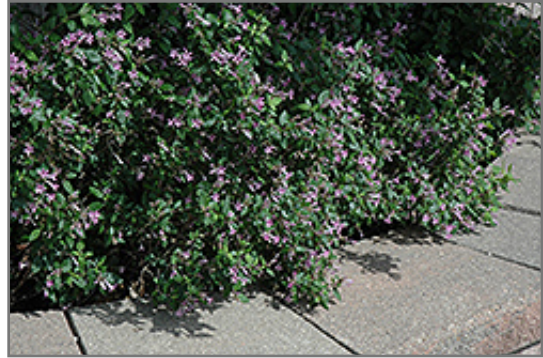
Leptodermis in bloom

This shrub does best in full sun to partial shade. It prefers to grow in average to moist conditions, and shouldn't be allowed to dry out. It is not particular as to soil type or pH. It is somewhat tolerant of urban pollution. This species is not originally from North America.