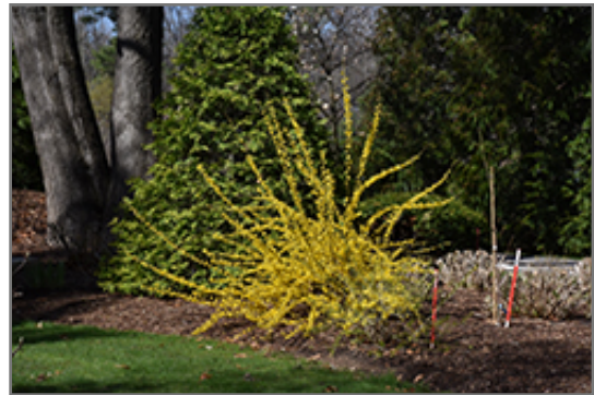
Show Off Forsythia in bloom