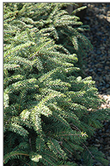
Elegans Spruce foliage