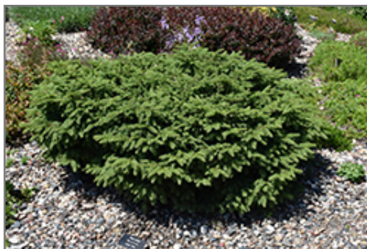
Elegans Spruce

This shrub should only be grown in full sunlight. It does best in average to evenly moist conditions, but will not tolerate standing water. It is not particular as to soil type or pH, and is able to handle environmental salt. It is highly tolerant of urban pollution and will even thrive in inner city environments. This is a selected variety of a species not originally from North America.