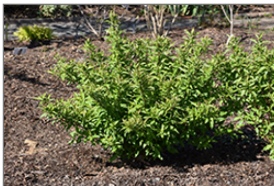
Red Gnome Dogwood

Red Gnome Dogwood is recommended for the following landscape applications;