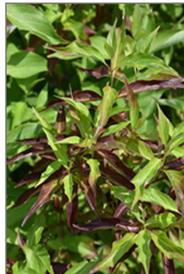
Red Gnome Dogwood foliage