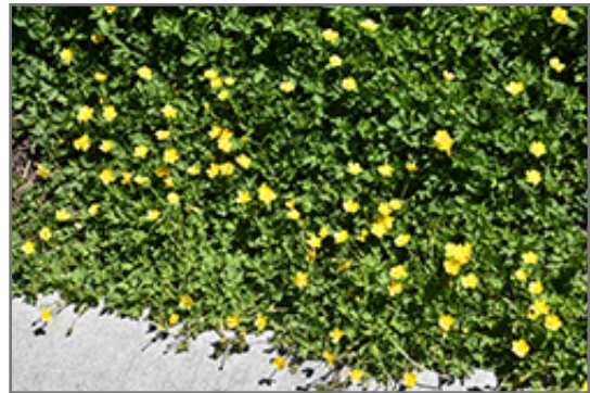
Barren Strawberry in bloom