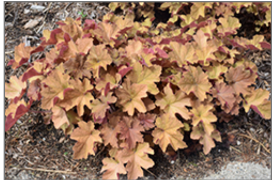
Caramel Coral Bells

Caramel Coral Bells is a fine choice for the garden, but it is also a good selection for planting in outdoor pots and containers. It is often used as a 'filler' in the 'spiller-thriller-filler' container combination, providing a mass of flowers and foliage against which the larger thriller plants stand out. Note that when growing plants in outdoor containers and baskets, they may require more frequent waterings than they would in the yard or garden.