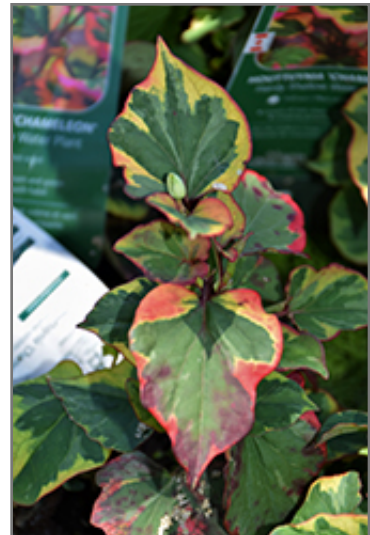
Variegated Chameleon Plant foliage