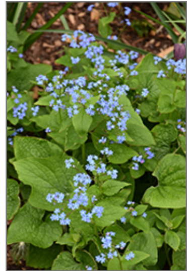
Siberian Bugloss flowers

Siberian Bugloss is recommended for the following landscape applications;