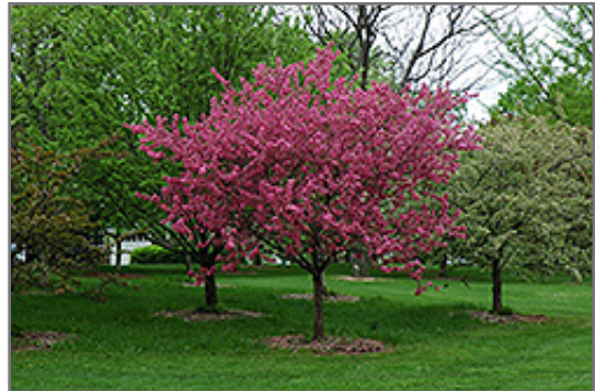
Prairifire Flowering Crab in bloom

Prairifire Flowering Crab is a deciduous tree with an upright spreading habit of growth. Its average texture blends into the landscape, but can be balanced by one or two finer or coarser trees or shrubs for an effective composition.