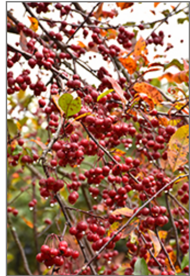
Prairifire Flowering Crab fruit

This tree should only be grown in full sunlight. It prefers to grow in average to moist conditions, and shouldn't be allowed to dry out. It is not particular as to soil type or pH. It is highly tolerant of urban pollution and will even thrive in inner city environments. This particular variety is an interspecific hybrid.