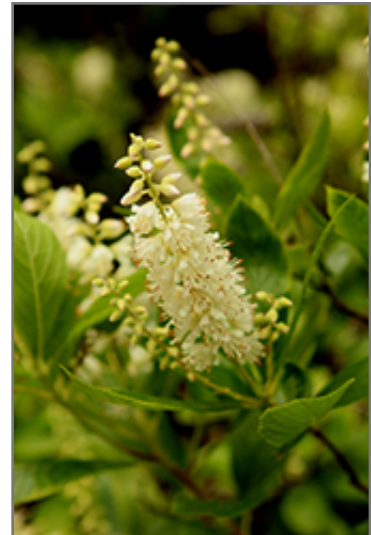
Summersweet flowers