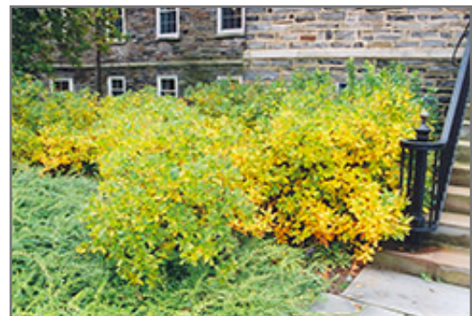
Summersweet in fall