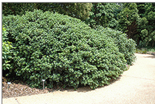
Roundleaf False Holly