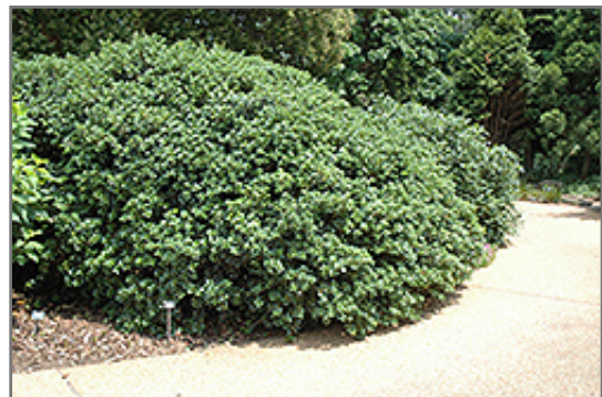
Roundleaf False Holly