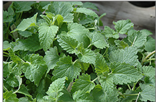
Catnip foliage

This plant will require occasional maintenance and upkeep, and is best cleaned up in early spring before it resumes active growth for the season. It is a good choice for attracting bees and butterflies to your yard, but is not particularly attractive to deer who tend to leave it alone in favor of tastier treats. Gardeners should be aware of the following characteristic(s) that may warrant special consideration;