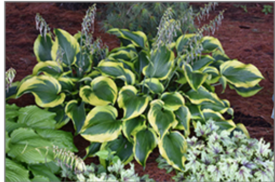
Atlantis Hosta