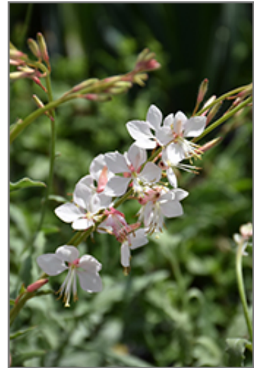
Whirling Butterflies Gaura flowers

Whirling Butterflies Gaura is an open herbaceous perennial with tall flower stalks held atop a low mound of foliage. It brings an extremely fine and delicate texture to the garden composition and should be used to full effect.