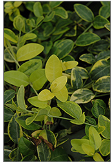
Sunny Skies Periwinkle flowers