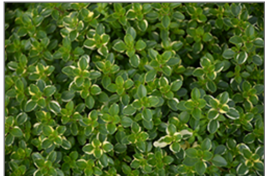
Variegated Broadleaf Thyme foliage