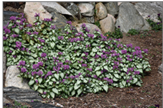
Purple Dragon Spotted Dead Nettle in bloom