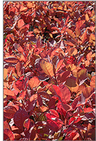
Grace Smokebush in fall

This shrub should only be grown in full sunlight. It is very adaptable to both dry and moist locations, and should do just fine under average home landscape conditions. It is not particular as to soil type or pH. It is highly tolerant of urban pollution and will even thrive in inner city environments, and will benefit from being planted in a relatively sheltered location. This particular variety is an interspecific hybrid.