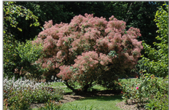
Grace Smokebush in bloom

This shrub will require occasional maintenance and upkeep, and is best pruned in late winter once the threat of extreme cold has passed. Deer don't particularly care for this plant and will usually leave it alone in favor of tastier treats. It has no significant negative characteristics.