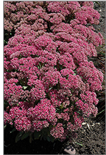
Mr. Goodbud Stonecrop flowers

This is a relatively low maintenance plant, and is best cleaned up in early spring before it resumes active growth for the season. It is a good choice for attracting bees and butterflies to your yard, but is not particularly attractive to deer who tend to leave it alone in favor of tastier treats. It has no significant negative characteristics.