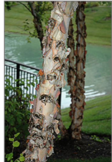
River Birch bark