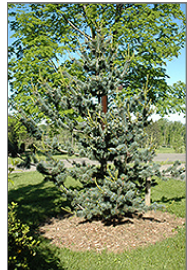
Short-Needled Japanese Blue Pine