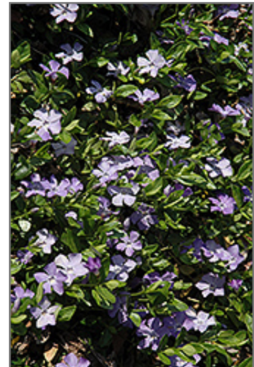
Common Periwinkle in bloom