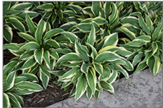
Wolverine Hosta