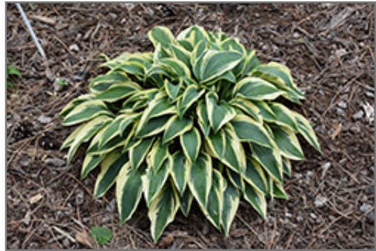
Wolverine Hosta

This plant does best in partial shade to shade. It prefers to grow in average to moist conditions, and shouldn't be allowed to dry out. It is not particular as to soil type or pH. It is somewhat tolerant of urban pollution. This particular variety is an interspecific hybrid. It can be propagated by division; however, as a cultivated variety, be aware that it may be subject to certain restrictions or prohibitions on propagation.