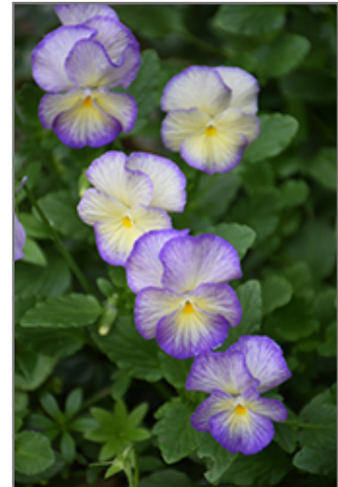
Etain Pansy flowers

Etain Pansy is recommended for the following landscape applications;