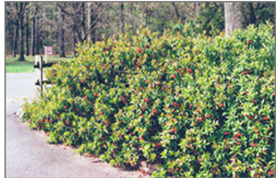
Wavy-leaved Chinese Stranvaesia fruit

Wavy-leaved Chinese Stranvaesia is a multi-stemmed evergreen shrub with a more or less rounded form. Its average texture blends into the landscape, but can be balanced by one or two finer or coarser trees or shrubs for an effective composition.