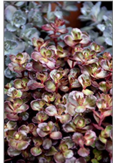
Voodoo Stonecrop foliage

Voodoo Stonecrop is recommended for the following landscape applications;