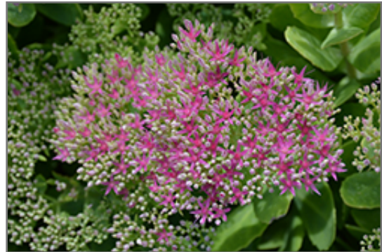
Neon Stonecrop flower buds