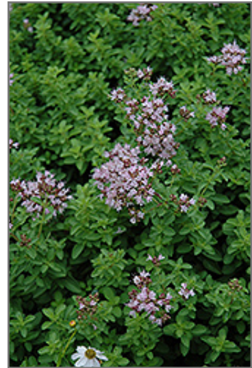
Dwarf Oregano flowers

Aside from its primary use as an edible, Dwarf Oregano is suitable for the following landscape applications;