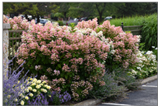
Quick Fire Hydrangea in bloom