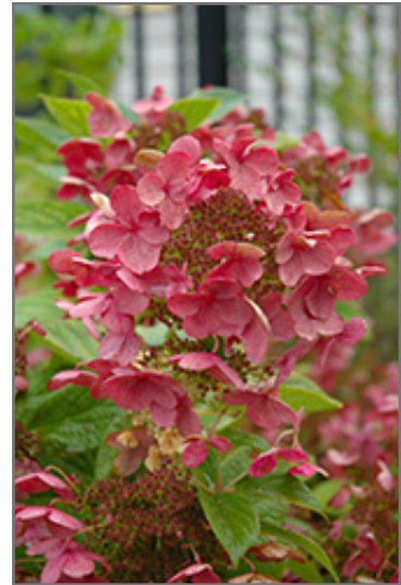
Quick Fire Hydrangea flowers (faded)

This shrub performs well in both full sun and full shade. It prefers to grow in average to moist conditions, and shouldn't be allowed to dry out. It is not particular as to soil type or pH. It is highly tolerant of urban pollution and will even thrive in inner city environments. Consider applying a thick mulch around the root zone in winter to protect it in exposed locations or colder microclimates. This is a selected variety of a species not originally from North America.