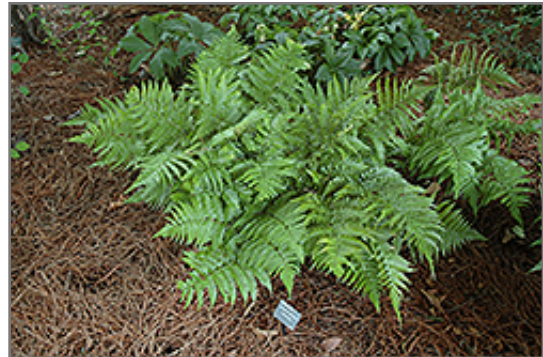
Autumn Fern

Autumn Fern will grow to be about 18 inches tall at maturity, with a spread of 18 inches. Its foliage tends to remain dense right to the ground, not requiring facer plants in front. It grows at a medium rate, and under ideal conditions can be expected to live for approximately 15 years. As an evergreen perennial, this plant will typically keep its form and foliage year-round.