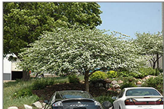
Thornless Cockspur Hawthorn in bloom