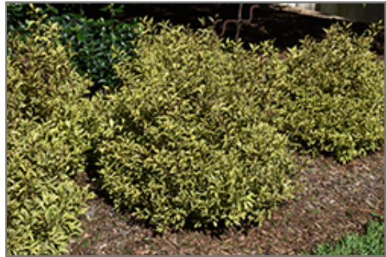
Bubbly Wine Weigela

Bubbly Wine Weigela will grow to be about 24 inches tall at maturity, with a spread of 3 feet. It tends to fill out right to the ground and therefore doesn't necessarily require facer plants in front. It grows at a medium rate, and under ideal conditions can be expected to live for approximately 30 years.