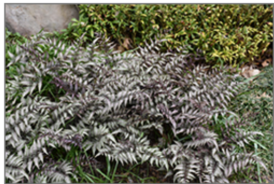
Pewter Lace Painted Fern