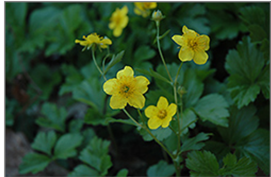
Barren Strawberry flowers