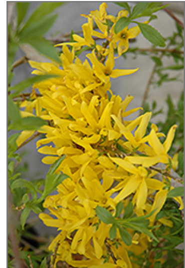
Gold Tide Forsythia flowers

Gold Tide Forsythia is recommended for the following landscape applications;