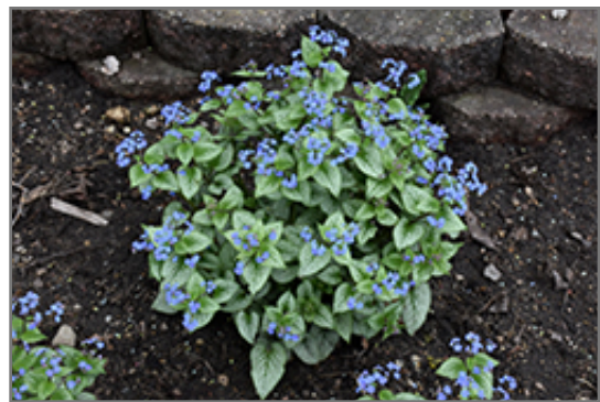
Sterling Silver Bugloss in bloom