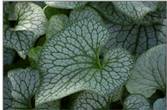
Sterling Silver Bugloss foliage

Sterling Silver Bugloss will grow to be about 12 inches tall at maturity, with a spread of 24 inches. When grown in masses or used as a bedding plant, individual plants should be spaced approximately 20 inches apart. It grows at a medium rate, and under ideal conditions can be expected to live for approximately 10 years. As an herbaceous perennial, this plant will usually die back to the crown each winter, and will regrow from the base each spring. Be careful not to disturb the crown in late winter when it may not be readily seen!